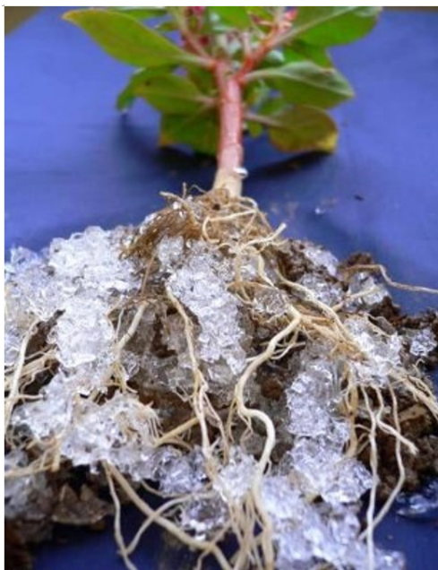
Figure 2. Super AB A200 SAP around plant root

al., 1997; Khalilpour, 2001; De Varennes & Queda, 2005) and delaying duration to wilting point in drought stress (Gehring & Lewis, 1980). Water conserving by gels creates a buffered environment which is effective in short term drought tensions and can reduce losses in the establishment phase of some plant species (Johnson & Leah 1990). Water consumption efficiency and dry matter production respond positively to Superabsorbent existence in soil (Woodhouse & Johnson, 1991; Shooshtarian et al., 2011). Figure 2 shows the SAP of super AB A200 around plant root.