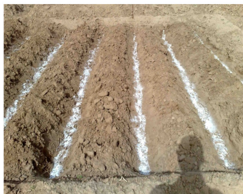
Figure 3. Application of SAP in ridge and furrow system

were used as the secondary treatment (S 0 , S 1 , S 2 and S 3 , equal to 0 (control), 15, 30 and 45 gr m -2 , respectively). The results revealed that the effect of Superabsorbent treatments on biologic and grain yield of corn was significant at 1% level. Besides, the independent effect of irrigation and SAP treatments at 1% level and interaction between them at 1% level on WUE of corn were significant. I 1 S 3 treatment had the most WUE amount (16.18 kg ha.mm -1 ) and I 3 S 0 treatment had the least WUE amount (6.48 kg ha.mm -1 ). Figure 3 shows the manner of putting SAP in the ridges. In this manner, SAPs are put on the furrows at first, after that they are hilled up by ridges soil (Khodadadi Dehkordi & Seyyedboveir, 2013d).